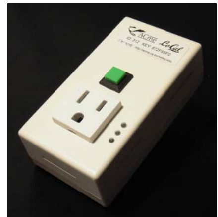
An ACme wireless power meter, developed and implemented as part of the LoCal project.

Power Savings Calculator: www.itpowersaving.com/power-saving-calculator